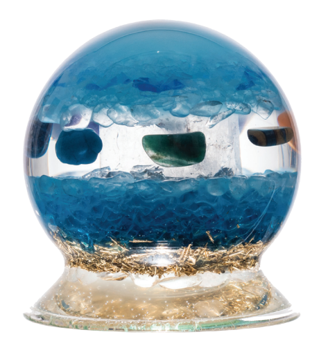
Blue light Price: 60 mm 690 CZK, 90 mm 1 290 CZ