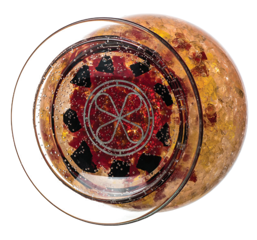
Candleholder Fire price 1 290 CZK