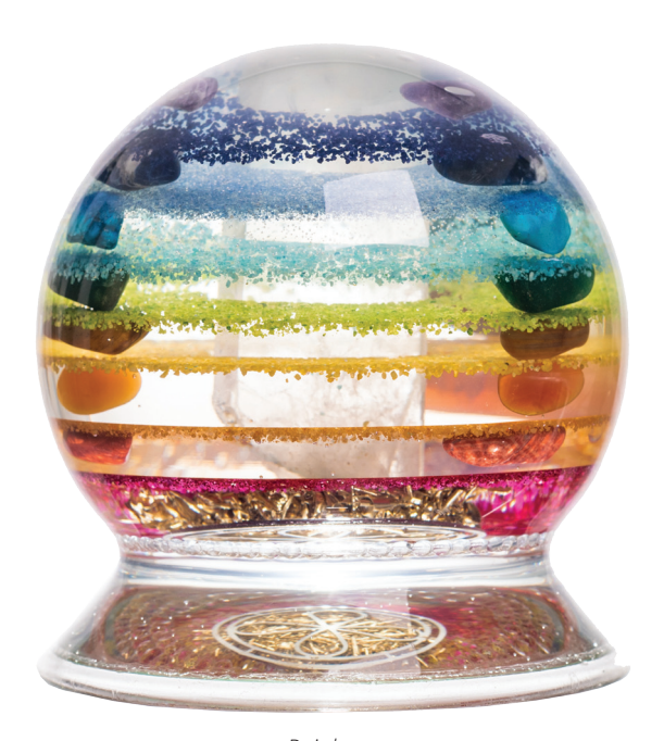
Rainbow Price: 60 mm 690 CZK, 90 mm 1 290 CZ