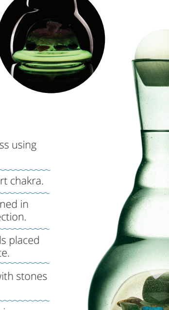
Orgon historical glass price 2 690 CZK