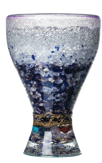
Amethyst cup price 1 390 CZK