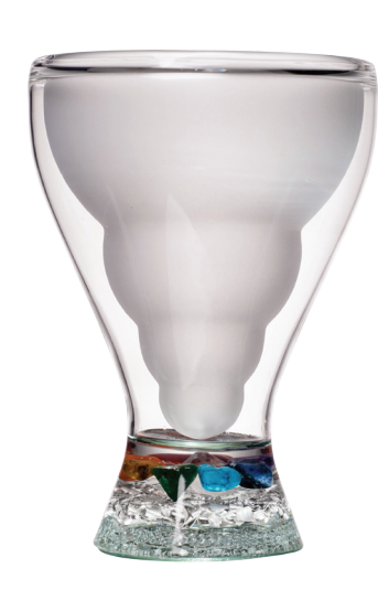
Ice cup price 1 290 CZK