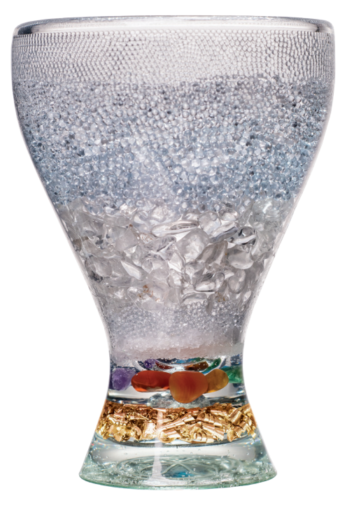
Crystal cup Price: 1 390 CZK