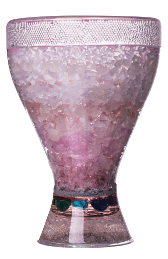
Rose quartz cup price 1 390 CZK