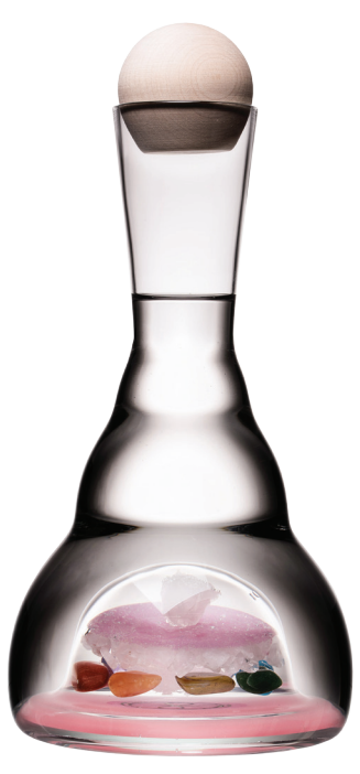
Orgon Rose price 2 690 CZK