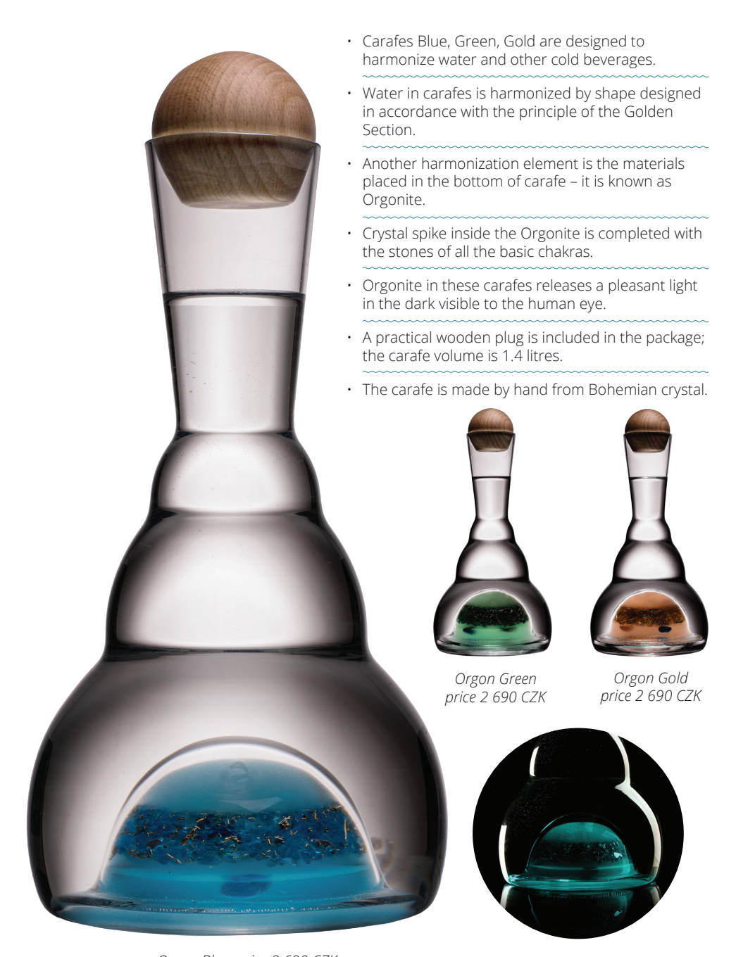
Orgon Blue, price 2 690 CZK