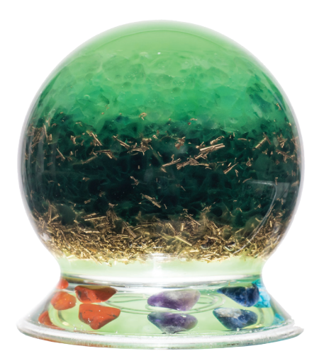
Green light Price: 60 mm 690 CZK, 90 mm 1 290 CZ