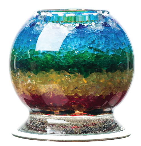
Candleholder Rainbow price 1 290 CZK